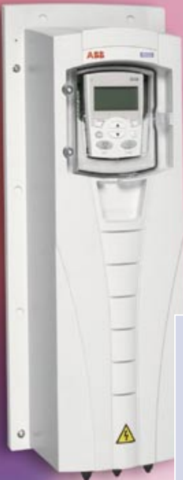
UL Type 12

ABB's HVAC drive is rated for continuous operation to 40 °C with full current, without being compromised by temperature variations within any 24-hour period. Full circulation is available, precisely when needed - usually, when it is hot outside. Similarly, Type 12 units can be operated without the need for derating up to 40°C. And, at 50°C, only 10% de-rating is required for both UL Type 1 and UL Type 12.