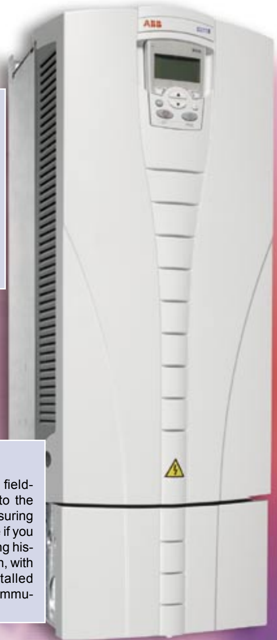
UL Type 1

LonWorks, Profibus and other plug-in modules fit under the cover of the drive. A single twisted pair avoids great lengths of conventional cabling, reducing cost and increasing system reliability.