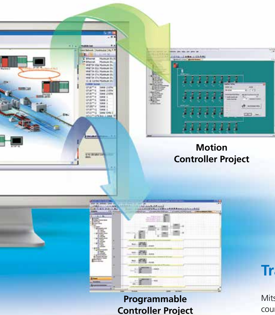
Motion Controller Project